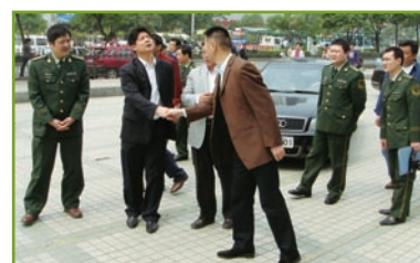
The Xiangfan city government officials were coming to inspect the operations of Hubei Shenzhou Group

As at 31 March 2009, this 100% (2008: 100%) owned subsidiary of the Group – once a state-owned enterprise – was holding a long-distance transport terminal with 92 routes (2008: 95) and a fleet of 240 (2008: 275) buses operating mainly long-distance bus services within Hubei Province. Under the state enterprise reform scheme, this subsidiary had successfully streamlined its human resource structure, and so its competitiveness was substantially enhanced. Owing to significant provisions for certain long outstanding receivables and tax, this subsidiary had incurred a loss for the year of approximately HK$5.1 million (2008: a profit of HK$2.6 million).