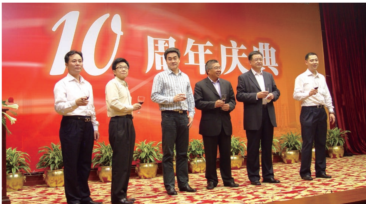
The management of GZ New Era was celebrating its 10th anniversary