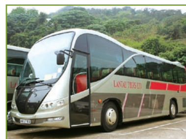
A new bus model of LT

The Group's subsidiaries, namely, Trade Travel (Hong Kong) Limited, TIL, and Vigor Airport Shuttle Services Ltd. ("Vigor Shuttle"), continued to operate commercial service counters at the Arrival Hall of the HKIA, and offered onward transfer for tour groups and individual visitors from overseas with pre-arranged bookings. In addition, Vigor Shuttle and Lantau Tours Limited ("LT"), another of the Group's wholly-owned subsidiary, operated travel itineraries for tourists on visit to Hong Kong and for tourists on transit. LT focused mainly on providing tour services in the Lantau Island.