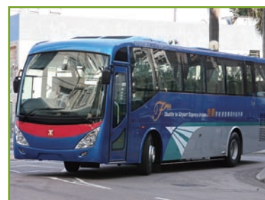
A new bus model of the Airport Shuttle Services

As at 31 March 2009, TIL had a fleet of 177 (2008: 166) limousines, of which 53 (2008: 50) had cross-border service licence. TIL had strengthened this fleet of limousines to cater mainly for VIP airport and local transfers, and cross-border transfers to and from the Guangdong Province. In addition, "TIL Travel" – the travel agency department of TIL – organized local tours to the Ocean Park and Disneyland, and its business included also sale of air tickets and other tour packages.