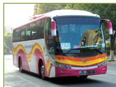
A cross-border bus of TIL was running on the Guangdong Xinhui route

The new Western Corridor via Shenzhen Bay Port provided some new opportunities to the Group. A considerable number of fixed routes operated by TIL had been diverted to the new crossing in view of the smoother traffic, better immigration facilities, one-spot-for-two immigration processing, and shorter journey time. It would be hopeful that this new crossing point could gain greater popularity, when the supporting networks in the vicinity areas would become more fully developed.