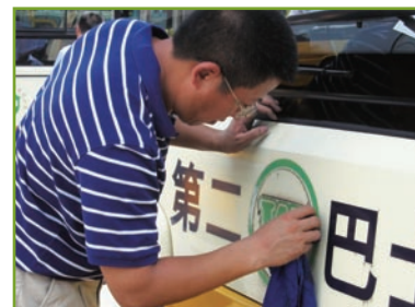
A bus cleaning campaign of GZ2B was led by its Managing Director