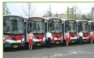
CQKC (New Town) was demonstrating its new bus fleet

As at 31 March 2009, this 42.15% (2008: 42.15%) effectively owned subsidiary was operating 29 (2008: 29) routes with a fleet of 681 (2008: 626) buses in Chongqing. The share of profit attributable to the Company for the year was approximately HK$11.4 million (2008: HK$7.7 million). The increase in profit was mainly due to the increase in government subsidies received and the enlargement of fleet size with the benefits of its bus routes operating in rapidly developing districts in the northern part of Chongqing.