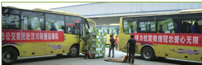
CQKC Public Transport had set up a rescue transport team after the 5.12 Sichuan Earthquake

As at 31 March 2009, this 30.25% (2008: 30.25%) effectively owned subsidiary was operating 76 (2008: 76) routes with a fleet of 937 (2008: 930) buses mainly in the southern part of Chongqing. The share of loss attributable to the Company for the year was approximately HK$1.2 million (2008: HK$4.1 million). In prior year, this subsidiary had paid net compensation after insurance coverage amounting to approximately RMB6.5 million (attributable to the Company: HK$2.2 million) for a serious fire accident that occurred on one of its running buses.