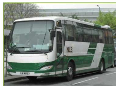
A new bus model of NLB

The Group's franchised bus services in Hong Kong were provided by New Lantao Bus Company (1973) Limited ("NLB"), a 99.99% owned subsidiary of the Group. As at 31 March 2009, NLB was operating 23 (2008: 23) franchised bus routes, mainly in Lantau Island, with a fleet of 104 (2008: 97) buses. For the year ended 31 March 2009, the total turnover of NLB was approximately HK$94.8 million (2008: HK$93.9 million) and it recorded a loss of approximately HK$35,000 (2008: a profit of approximately HK$4.9 million).