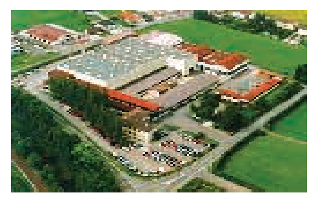
THEN Maschinen GmbH in Schwäbisch Hall, Germany

As disclosed in our Interim Report 2004, the Group acquired from the insolvency administrators of Then Maschinen- und Apparatebau GmbH and Scholl-Then AG (collectively the "SCHOLL-THEN Group") certain production facilities and intellectual property rights including the technology and know-how relating to the manufacture of dyeing and finishing machines for a cash consideration of approximately HK$55 million. The SCHOLL-THEN Group was a leading European dyeing machine manufacturer with its renowned "SCHOLL" and "THEN" branded products. This strategic investment will enable the Group to further complement its "FONG'S" branded product range with the "SCHOLL" and "THEN" branded products in the global markets.